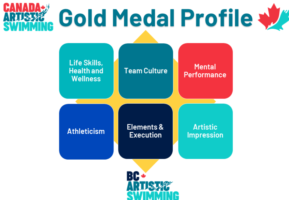
Figure 2 – Canada Artistic Swimming Gold Medal Profile

The athlete and coach nomination cycle for Canadian Sport Institute / PacificSport / BC Artistic Swimming targeting runs October 1 – September 30 annually, and athletes are selected based on prior competition results, monitoring and program participation as outlined herein. Athletes who meet criteria throughout the annual nomination cycle may be added to the BC Artistic Swimming targeted athlete list, on a case-by-case basis, by contacting the BC Artistic Swimming Technical Representative.